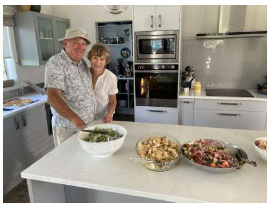
OUR WONDERFUL HOSTS