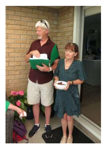
THE PRIZEGIVING. HOW WELL DID YOU DO?