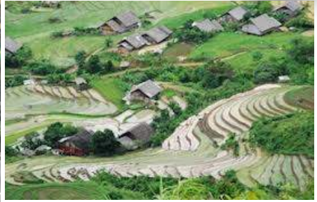
One of the worlds largest Rice exporters