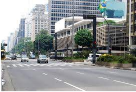
Modern Ho Chi Min City